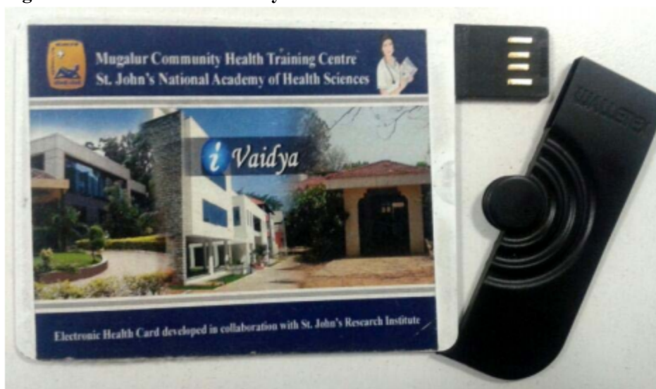
Figure 1: USB-based Memory Card

Two data entry clerks (DECs) were recruited from the local community and trained on medical terminologies two months prior